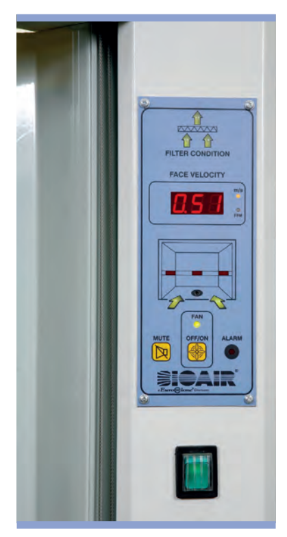
Safehood 120 detail