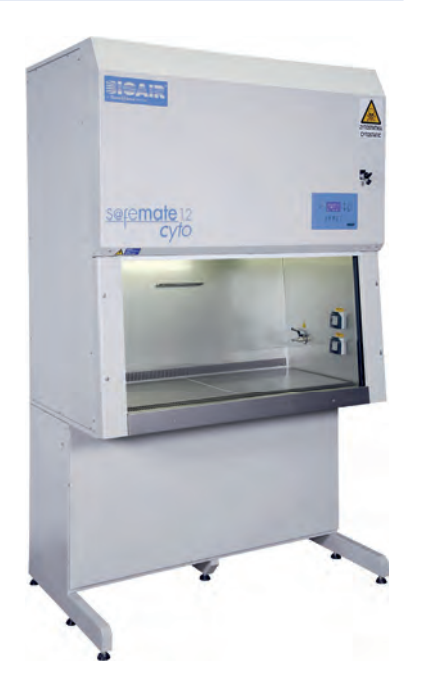
Patented BagIn/BagOut system to replace first stage filters safely